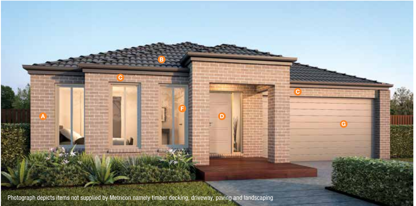
Photograph depicts items not supplied by Metricon namely timber decking, driveway, paving and landscaping