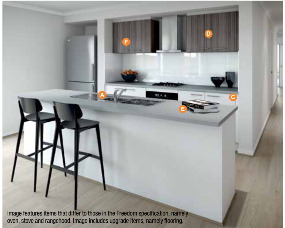
Image features items that differ to those in the Freedom specification, namely oven, stove and rangehood. Image includes upgrade items, namely flooring.