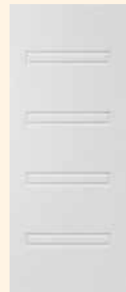
Corinthian Urban PURB 104