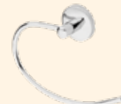
Hand Towel Holder