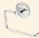
Toilet Roll Holder