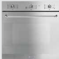
Smeg Electric Oven