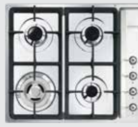
Smeg Gas Cooktop