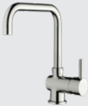
Alder Mixer Tap